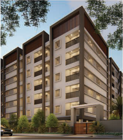
Dev Dar, Siddipet 2022 - Completed, 50 Units