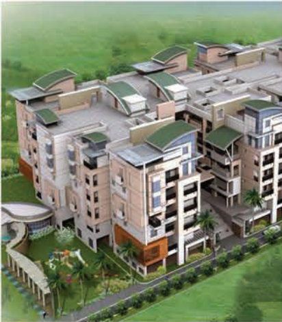
Bonsai Homes, Tellapur 2015 - Completed, 215 Units