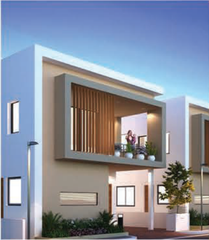
Bhuvi Villas, Siddipet 2022 - Completed, 71 Units