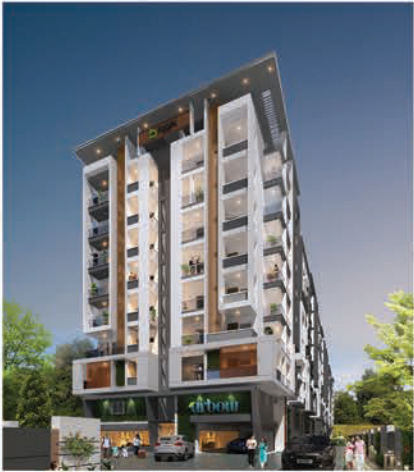
Arbour, Tellapur 2021 - Completed, 182 Units